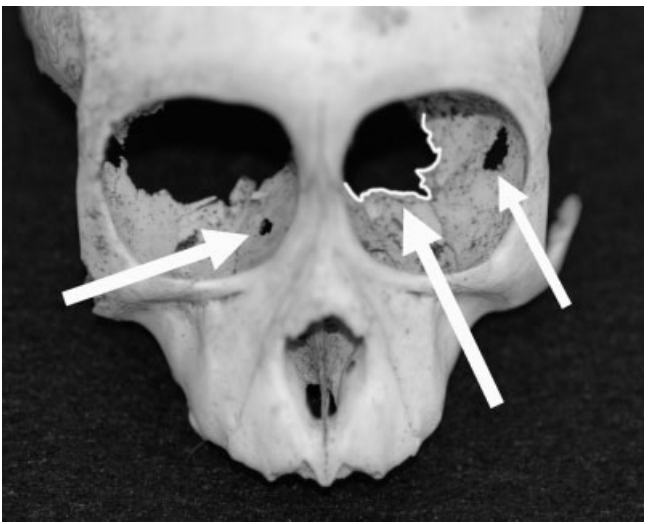
Fig. 4. Frontal close-up of crowned hawk eagle-damaged cercopithecid skull from Ivory Coast's Tai Forest. Arrows indicate talonmade puncture mark and ragged tear in base of left and right orbits. Anterior edge of damage to left orbital floor is highlighted.

Fig. 3. Close-up of inferior portion of orbits of Taung. Anterior edge of damage to left orbital floor is highlighted. Posterior extent of damage is obscured by adherent matrix.