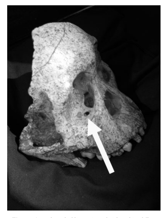
Fig. 2. Anterolateral oblique view of right orbit of Taung shows puncture damage to orbital floor.

damage to the skulls of primates killed and eaten by crowned eagles that were not previously given such attention. While concluding that indeed the evidence collected adds weight to the "bird of prey" hypothesis, McGraw et al. (this issue) note (following McKee, 2001) that the lack of distinctive predatory bird-caused damage to the Taung skull itself remains a weakness that prevents final acceptance of this theory.